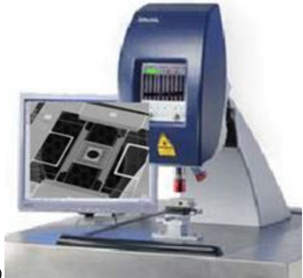
Figure 1 : (a) 3D Metamaterial fabricated with the Nanoscribe @ FEMTO-ST (b) MEMS analyser.