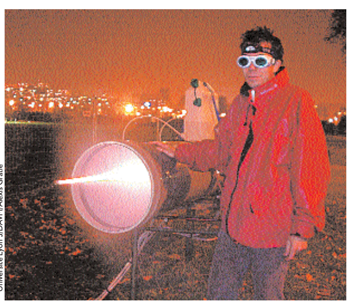
On a foggy night outside Lyon, France, when regular laser beams would be scattered, stable filaments of 400-mJ, 100-fs laser pulses are detected by a cloud chamber over a distance of 50 m.

the broader laser beam. As long as the surrounding beam had enough energy, the filament was almost unaffected by the fog